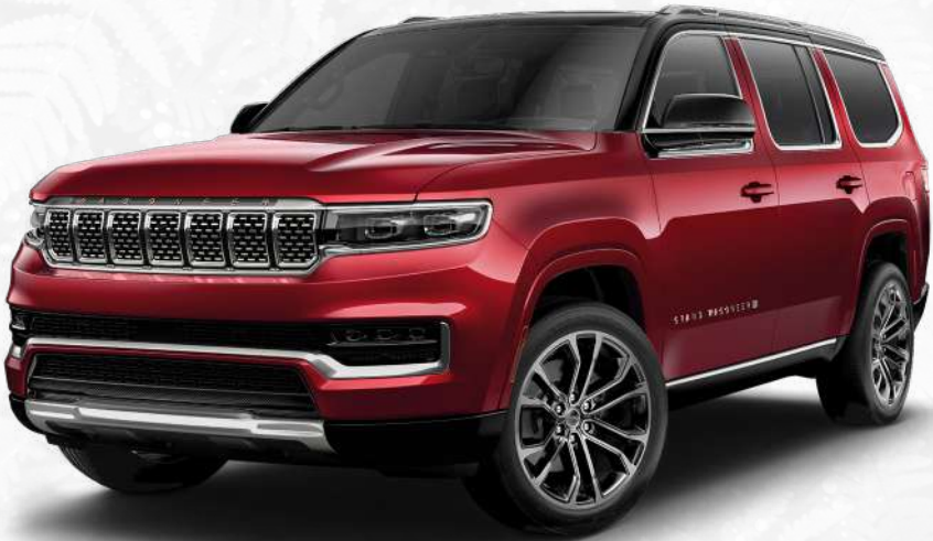
Grand Wagoneer Series III in Velvet Red Pearl