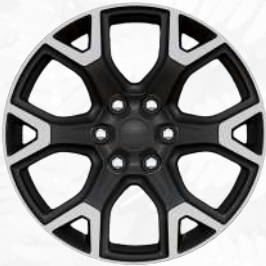
20-inch Machined-Face Painted Aluminum (Standard with Advanced All-Terrain Group)