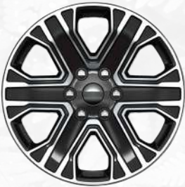
20-inch Machined Aluminum with Black Noise Pockets (Standard)