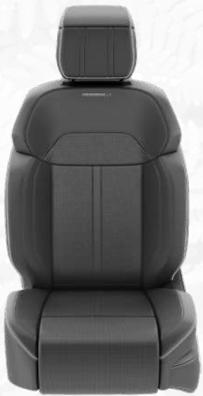
Ventilated Palermo Leather-Trimmed with Registered Perforations and Global Black/Smoke Accent Stitching — Global Black (Standard)