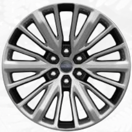
22-inch Polished Aluminum with Lights Out Pockets (Standard)