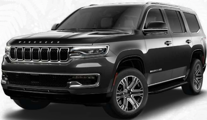
Wagoneer in Baltic Gray Metallic