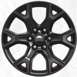
20-inch Aluminum Painted Gloss Black (Standard with Carbide Package)