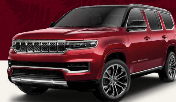
Velvet Red Pearl