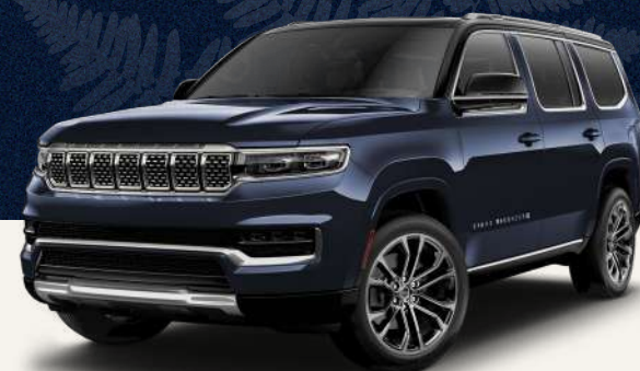
Midnight Sky (Grand Wagoneer exclusive)