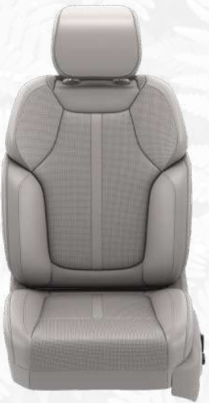
Ventilated Capri Leather-Trimmed with Axis II Perforations and Sea Salt/Basil Accent Stitching — Sea Salt/Global Black (Standard)