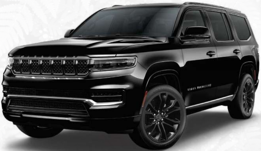
Grand Wagoneer Obsidian in Diamond Black Crystal Pearl