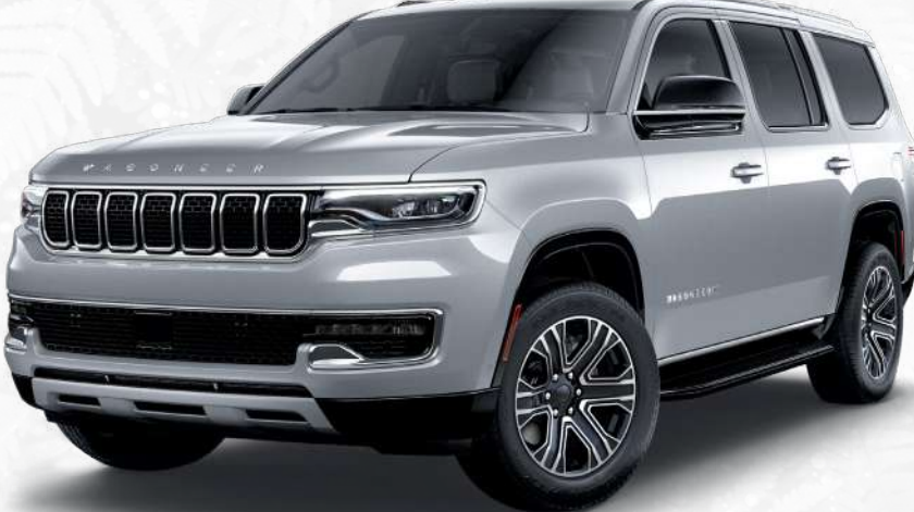
Wagoneer Series II in Silver Zynith