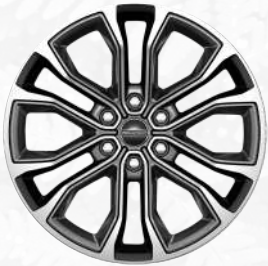
22-inch Machined Aluminum with Black Noise Pockets (Standard)