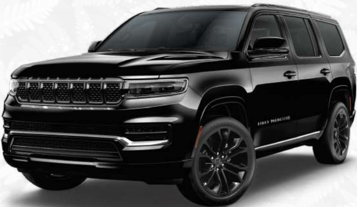
Grand Wagoneer Series III Obsidian in Diamond Black Crystal Pearl