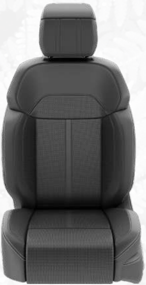
Ventilated Nappa Leather-Trimmed with Axis II Perforations and Global Black/Smoke Accent Stitching — Global Black (Standard)