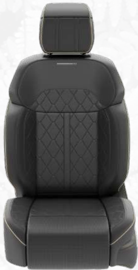
Ventilated Palermo Leather-Trimmed with Quilted Registered Perforations and Global Black/Terra Cotta Accent Stitching, Sea Salt Piping — Global Black (Standard)