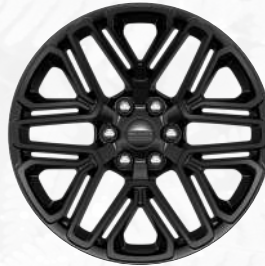
22-inch Aluminum Painted Gloss Black (Standard with Heavy-Duty Trailer-Tow Package; Available with Carbide Package)