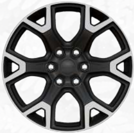
20-inch Machined-Face Painted Aluminum (Standard)