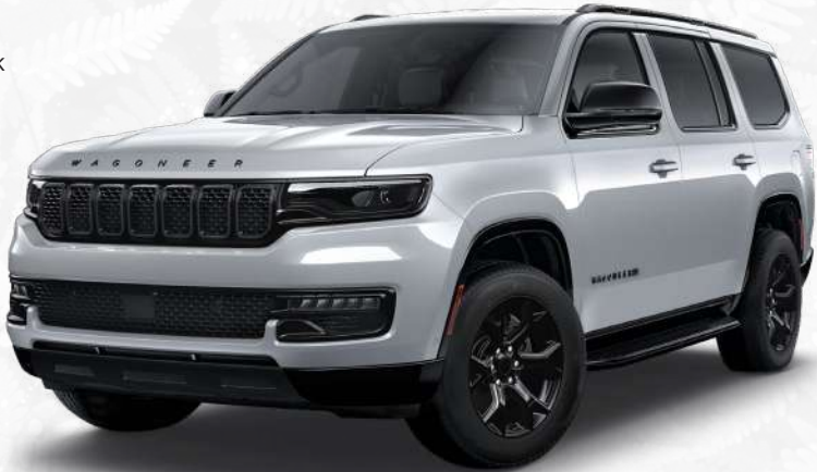
Wagoneer Carbide in Silver Zynith