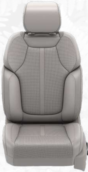
Ventilated Nappa Leather-Trimmed with Axis II Perforations and Sea Salt/Basil Accent Stitching — Sea Salt/Global Black (Standard)