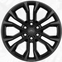
22-inch Gloss Black Aluminum with Black Inserts (Standard with Obsidian Package)