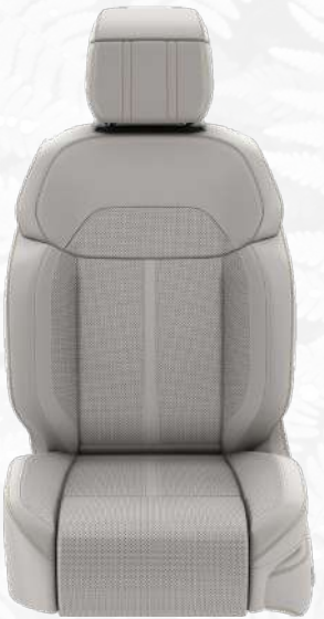
Ventilated Nappa Leather-Trimmed with Axis II Perforations and Sea Salt/Cognac Accent Stitching — Sea Salt/Global Black (Standard)