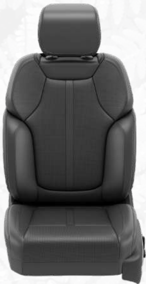
Ventilated Nappa Leather-Trimmed with Axis II Perforations and Global Black/Smoke Accent Stitching — Global Black (Standard)