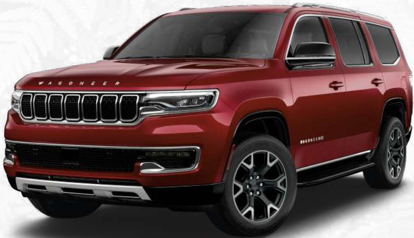
Wagoneer Series III in Velvet Red Pearl