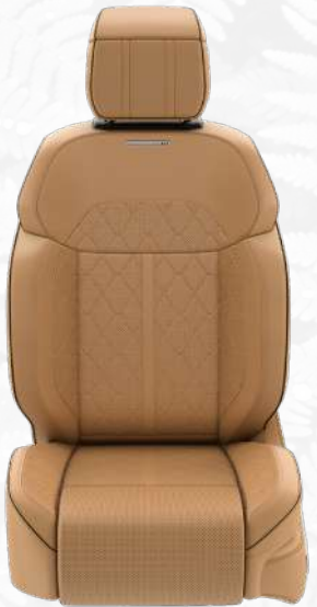
Ventilated Palermo Leather-Trimmed with Quilted Registered Perforations and Tupelo/Terra Cotta Accent Stitching, Global Black Piping — Tupelo/Global Black (Standard)