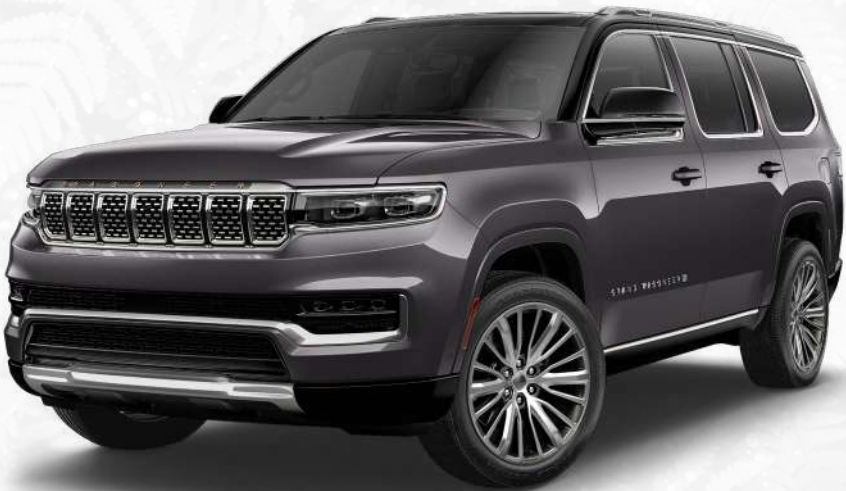
Grand Wagoneer in Baltic Gray Metallic