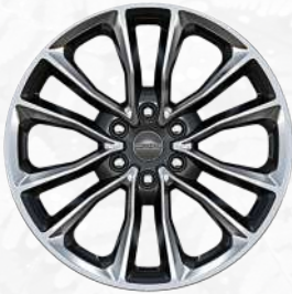
22-inch Polished Aluminum with Black Noise Pockets (Standard with Premium Group on standard wheelbase 4x4 models)