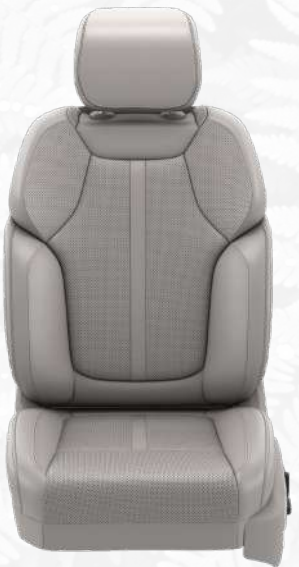
Ventilated Nappa Leather-Trimmed with Axis II Perforations and Sea Salt/Basil Accent Stitching — Sea Salt/Global Black (Standard)