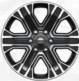
20-inch Machined Aluminum with Black Noise Pockets (Standard)