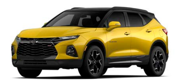
Black/Nitro Yellow Metallic1,2