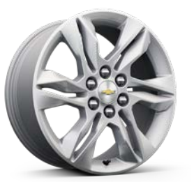
18" Bright Silver-Painted Aluminum Wheels Standard on 3LT