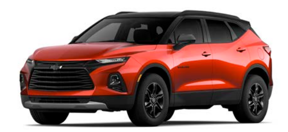
Black/Cayenne Orange Metallic1,2