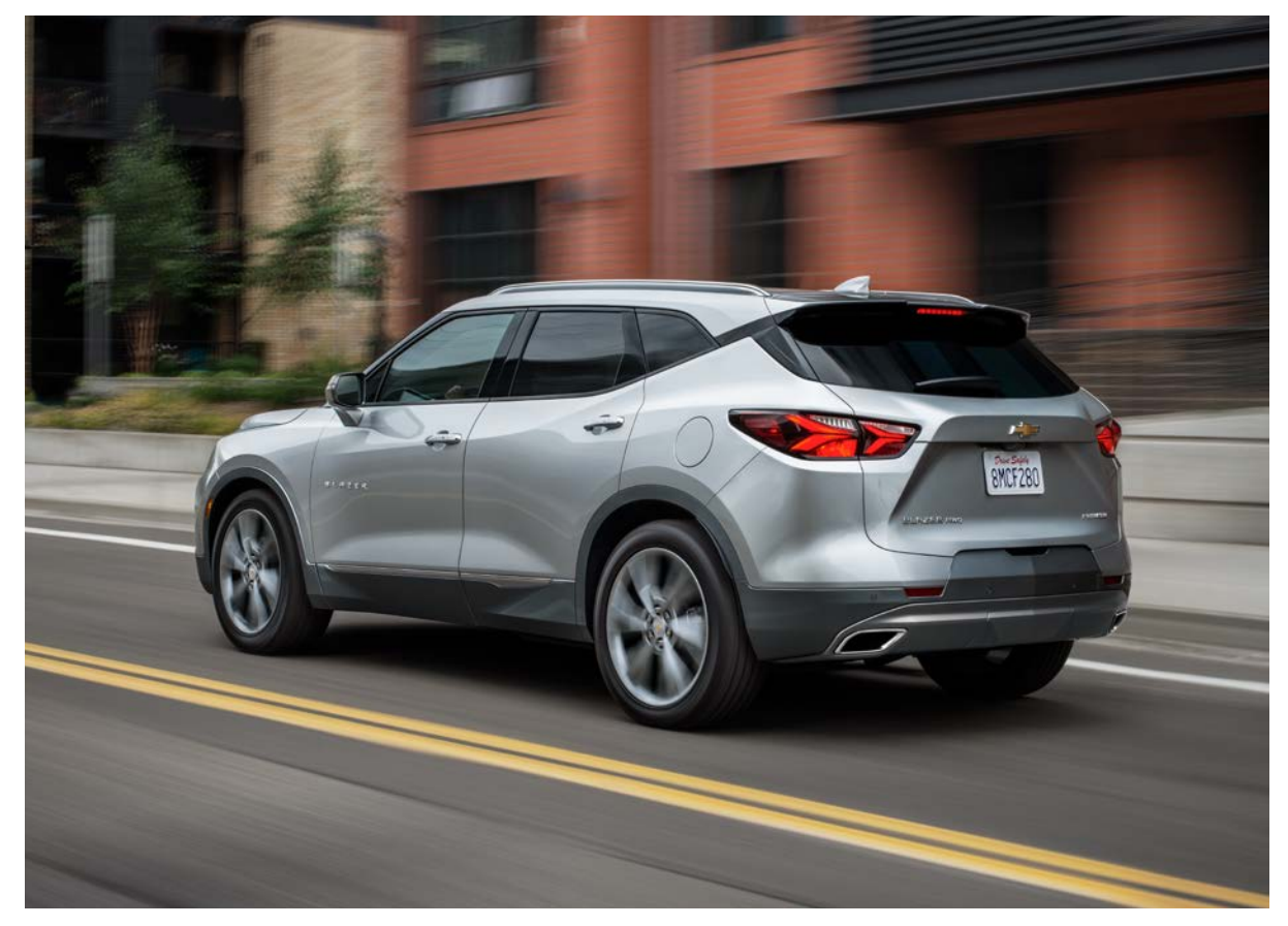
Blazer Premier in Silver Ice Metallic.

Prepare to live your best life in Blazer.