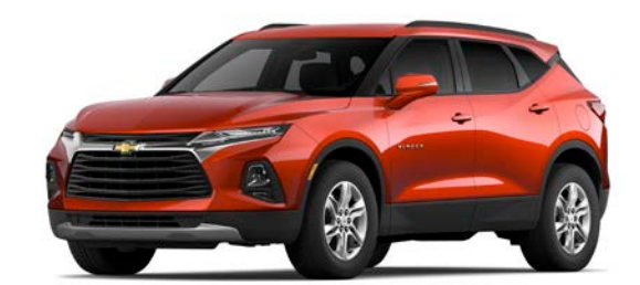
Cayenne Orange Metallic<sup>1</sup>