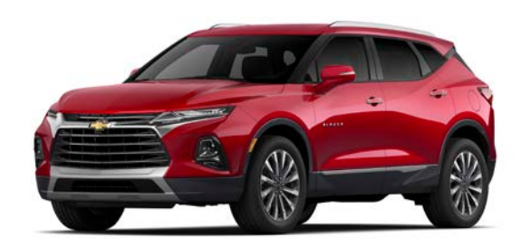
Cherry Red Tintcoat<sup>1</sup>