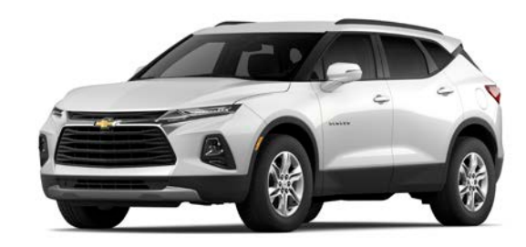
Iridescent Pearl Tricoat<sup>1</sup>