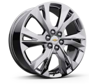
21" Pearl Nickel-Painted Aluminum Wheels Available on Premier

1 Chevrolet Infotainment System functionality varies by model. Full functionality requires compatible Bluetooth and smartphone, and USB connectivity for some devices. 2 Map coverage available in the United States, Puerto Rico and Canada. 3 Safety or driver assistance features are no substitute for the driver's responsibility to operate the vehicle in a safe manner. Read the vehicle Owner's Manual for important feature limitations and information. 4 If you decide to continue service after your trial, your selected subscription plan will automatically renew thereafter. You will be charged at then-current rates. Fees and taxes apply. To cancel you must call SiriusXM at 1-866-635-2349. See SiriusXM Customer Agreement for complete terms at siriusxm.com. All fees and programming subject to change. Certain features require a SiriusXM subscription and the Chevrolet Connected Access plan. See siriusxm.com and onstar.com for details and limitations.