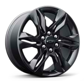
18" Gloss Black-Painted Aluminum Wheels Available on 2LT with Midnight/Sport Edition