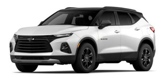
Black/Iridescent Pearl Tricoat<sup>1,2</sup>