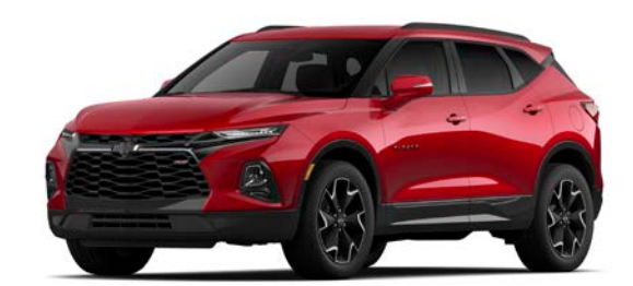
Cherry Red Tintcoat<sup>1</sup>