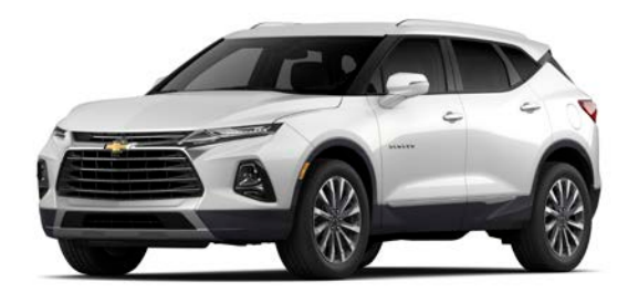
Iridescent Pearl Tricoat1