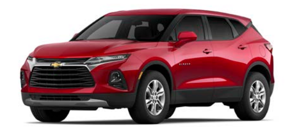
Cherry Red Tintcoat<sup>1</sup>