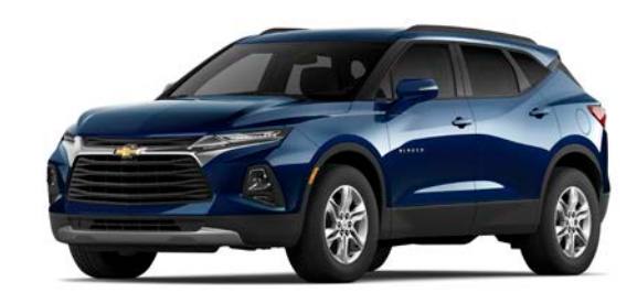
Blue Glow Metallic