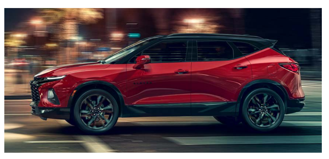
Blazer RS in Red Hot with available features.