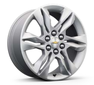
18" Bright Silver-Painted Aluminum Wheels Standard on 2LT