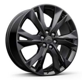
21" Gloss Black-Painted Aluminum Wheels Available on RS

1 Chevrolet Infotainment System functionality varies by model. Full functionality requires compatible Bluetooth and smartphone, and USB connectivity for some devices. 2 Map coverage available in the United States, Puerto Rico and Canada. 3 Safety or driver assistance features are no substitute for the driver's responsibility to operate the vehicle in a safe manner. Read the vehicle Owner's Manual for important feature limitations and information. 4 If you decide to continue service after your trial, your selected subscription plan will automatically renew thereafter. You will be charged at then-current rates. Fees and taxes apply. To cancel you must call SiriusXM at 1-866-635-2349. See SiriusXM Customer Agreement for complete terms at siriusxm.com. All fees and programming subject to change. Certain features require a SiriusXM subscription and the Chevrolet Connected Access plan. See siriusxm.com and onstar.com for details and limitations.