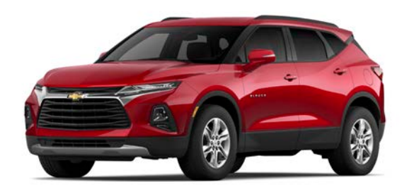
Cherry Red Tintcoat<sup>1</sup>