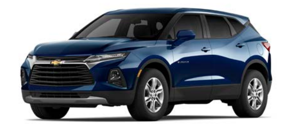
Blue Glow Metallic