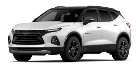
Black/Iridescent Pearl Tricoat<sup>1,2</sup>