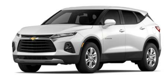
Iridescent Pearl Tricoat<sup>1</sup>