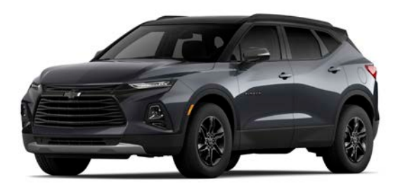
Black/Iron Gray Metallic<sup>2</sup>