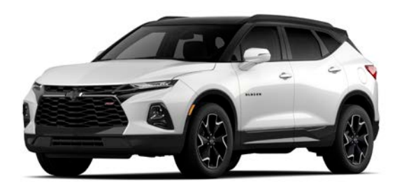
Black/Iridescent Pearl Tricoat<sup>1,2</sup>