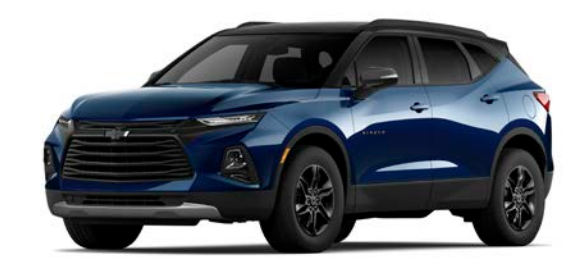
Black/Blue Glow Metallic<sup>2</sup>