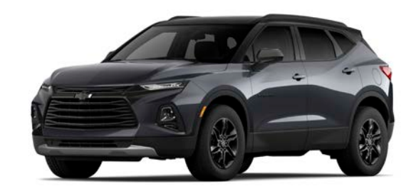
Black/Iron Gray Metallic<sup>2</sup>