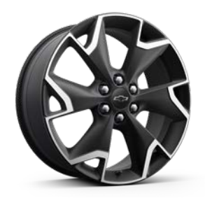
20" Machined-Face Aluminum Wheels with Dark Android-Painted Pockets Standard on RS