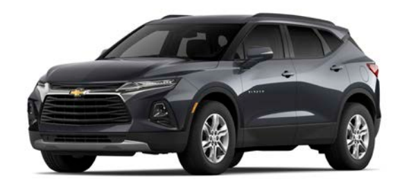
Iron Gray Metallic