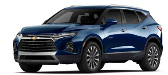
Blue Glow Metallic