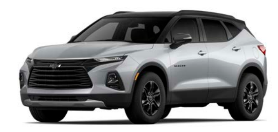
Black/Silver Ice Metallic<sup>3</sup>