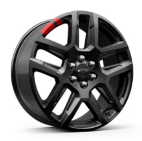
20" Gloss Black-Painted Aluminum Wheels with Red Accents Available on 2LT with Redline Edition

1 Chevrolet Infotainment System functionality varies by model. Full functionality requires compatible Bluetooth and smartphone, and USB connectivity for some devices. 2 Not compatible with all devices. 3 If you decide to continue service after your trial, your selected subscription plan will automatically renew thereafter. You will be charged at then-current rates. Fees and taxes apply. To cancel you must call SiriusXM at 1-866-635-2349. See SiriusXM Customer Agreement for complete terms at siriusxm.com. All fees and programming subject to change. 4 Not available with Summit White, Red Hot or Cayenne Orange Metallic exterior colors.