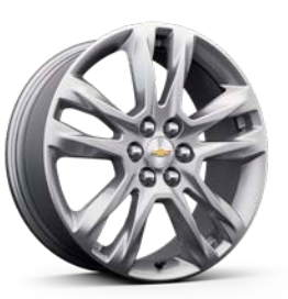
20" Bright Silver-Painted Aluminum Wheels Available on 3LT