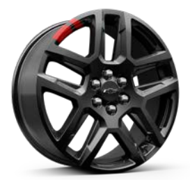
20" Gloss Black-Painted Aluminum Wheels with Red Accents Available on 3LT with Redline Edition

1 Chevrolet Infotainment System functionality varies by model. Full functionality requires compatible Bluetooth and smartphone, and USB connectivity for some devices. 2 Safety or driver assistance features are no substitute for the driver's responsibility to operate the vehicle in a safe manner. Read the vehicle Owner's Manual for important feature limitations and information. 3 If you decide to continue service after your trial, your selected subscription plan will automatically renew thereafter. You will be charged at then-current rates. Fees and taxes apply. To cancel you must call SiriusXM at 1-866-635-2349. See SiriusXM Customer Agreement for complete terms at siriusxm.com. All fees and programming subject to change. 4 Not available with Summit White, Red Hot or Cayenne Orange Metallic exterior colors.