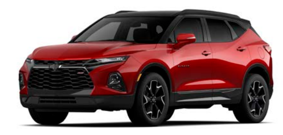
Black/Cherry Red Tintcoat<sup>1,2</sup>