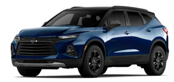
Black/Blue Glow Metallic<sup>2</sup>