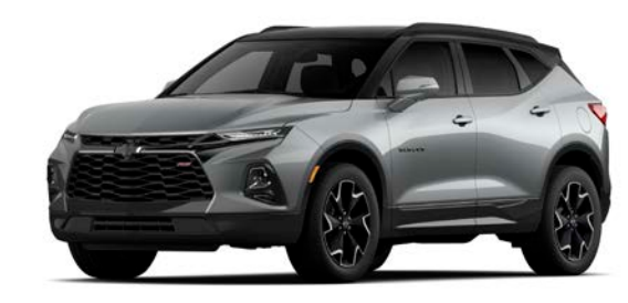
Black/Silver Ice Metallic<sup>2</sup>