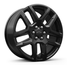
20" Gloss Black-Painted Aluminum Wheels Available on 2LT