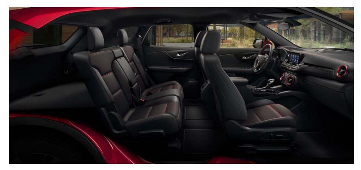
Blazer RS interior in Jet Black with Red accents and available features.

1 Safety or driver assistance features are no substitute for the driver's responsibility to operate the vehicle in a safe manner. Read the vehicle Owner's Manual for important feature limitations and information. 2 With available 3.6L V6 engine and trailering equipment. Maximum trailering ratings are intended for comparison purposes only. Before you buy a vehicle or use it for trailering, carefully review the Trailering section of the Owner's Manual. The trailering capacity of your specific vehicle may vary. The weight of passengers, cargo and options or accessories may reduce the amount you can trailer. 3 Cargo and load capacity limited by weight and distribution. 4 Vehicle user interface is a product of Apple and its terms and privacy statements apply. Requires the Android Auto app on Google Play and a compatible Android smartphone. Data plan rates apply. You can check which smartphones are compatible at g.co/androidauto/requirements.