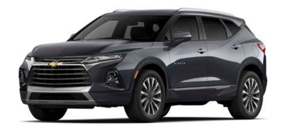
Iron Gray Metallic