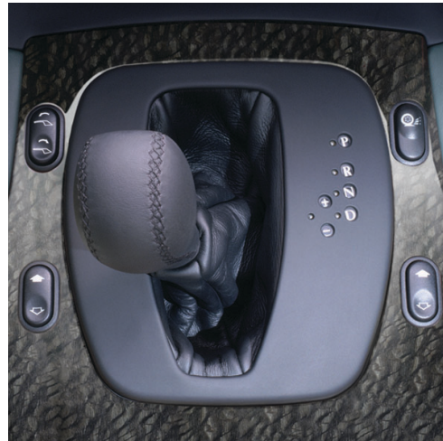
Touchtronic transmission – steering wheel controls and gear shift.