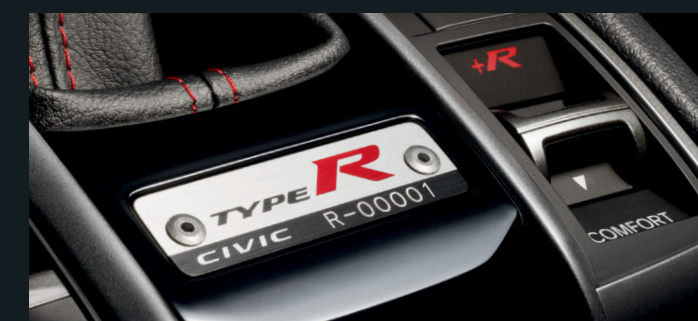
Civic Type R Touring shown with Red / Black Suede-Effect Fabric.

Every Type R is fitted with a unique serial number—becoming a one-of-a-kind vehicle that can only be yours alone.