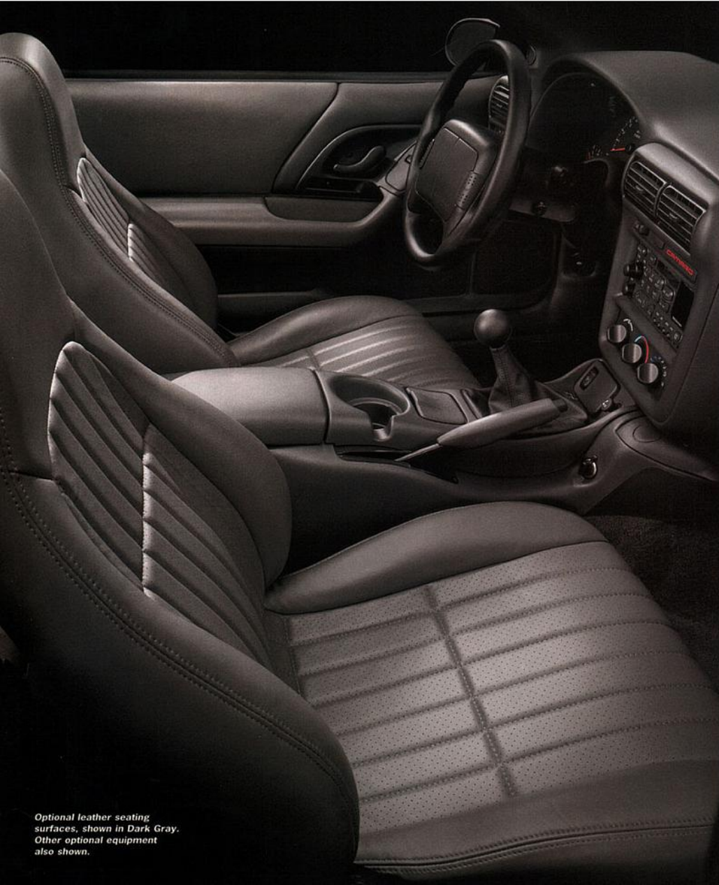
Optional leather seating surfaces, shown in Dark Gray. Other optional equipment also shown.