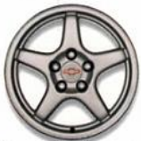
17" cast-aluminum wheel. Included in SS Performance/ Appearance Package.