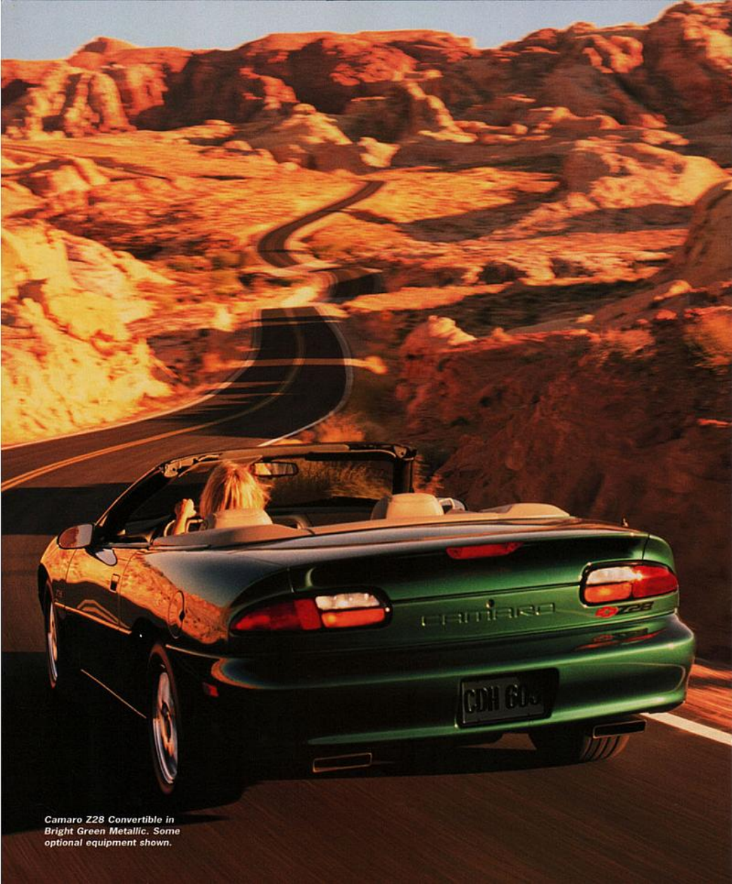
Camaro Z28 Convertible in Bright Green Metallic. Some optional equipment shown.