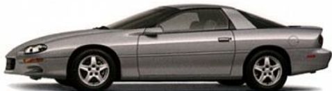
Sebring Silver Metallic Available Interiors: Dark Gray, White, Red Accent