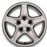
16" cast-aluminum wheel. Standard on Z28, optional on Camaro.