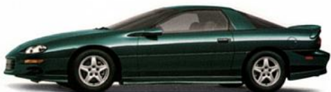
Mystic Teal Metallic (not available with Sport Appearance Package) Available Interiors: Dark Gray, Neutral, White