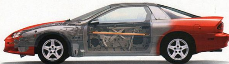
A high-strength body structure with steel side door beams is designed to provide structural integrity.

You'll feel secure in the well designed 1998 Camaro. Standard occupant protection features include Next Generation driver and front-passenger air bags,* 1 safety-cage construction and energy-absorbing front/rear crush zones. Crash avoidance features include Daytime Running Lamps, a brake/transmission shift interlock feature (automatic transmission), an advanced Bosch 4-wheel anti-lock brake system, tire tread wear indicators and audible front brake wear indicators. In a Camaro, you get these and many other standard safety features. That's excellence in design. That's Genuine Chevrolet.