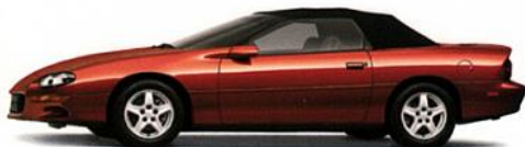
Cayenne Red Metallic (not available with Sport Appearance Package) Available Interiors: Dark Gray, Neutral, White