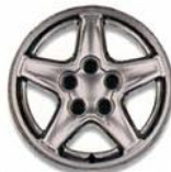
16" chrome-aluminum wheel. Optional on all models.