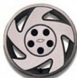
16" bolt-on wheel cover. Standard on Camaro.