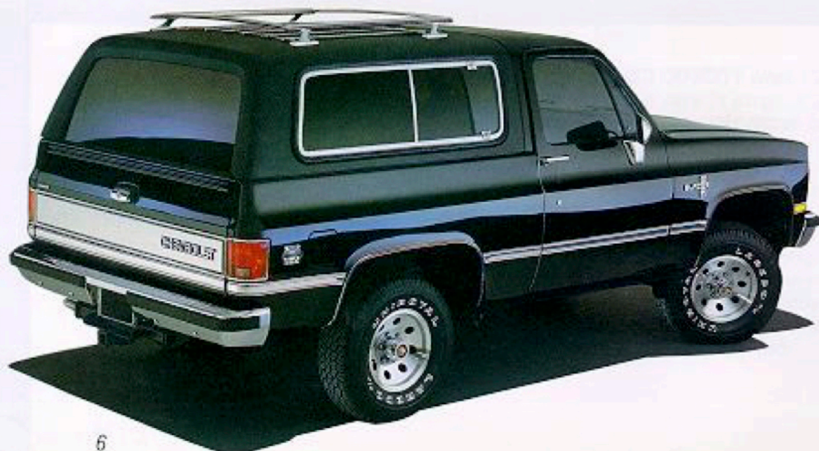
Full-size Blazer in Black, shown with the following optional items: Silverado trim, luggage rack (dealer-installed), deep-tinted windows, sliding rear side windows, power rear window, white-letter tires and aluminum wheels. Tires supplied by various manufacturers.

Custom Molding Package, Black Deluxe Molding Package, Bright ■ Operating Convenience Package (Power Door Locks and Power Windows) ■ Paint Options: Special Two-Tone Paint Exterior Decor Package ■ Radio Equipment, Delco AM/FM Stereo Radio w/Digital Clock