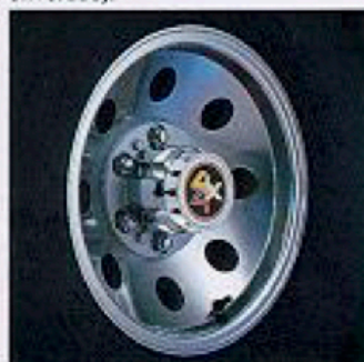
Optional aluminum wheels.