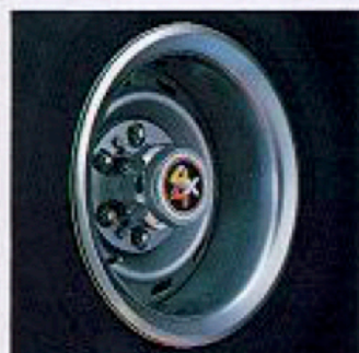
Optional Rally Wheels (standard on Silverado).