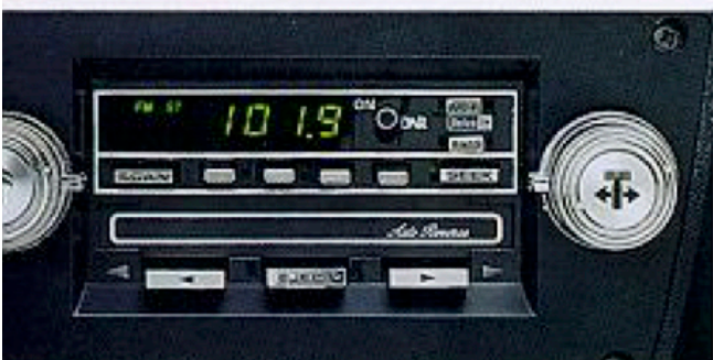
Optional Delco AM/FM stereo radio with cassette tape player, Seek and Scan and digital clock.