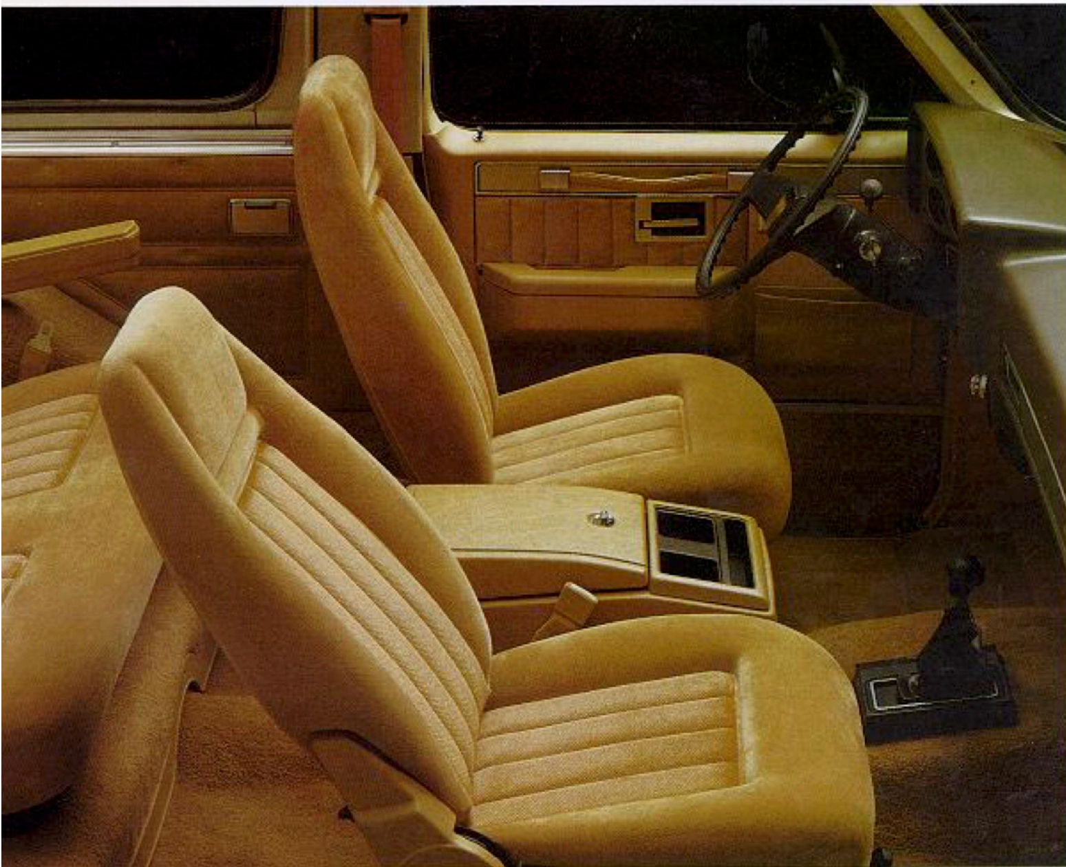
Optional Silverado interior trim in Saddle with Custom Cloth.