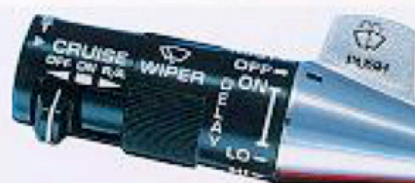
Optional electronic speed control and intermittent wipers are on the standard multi-function lever.