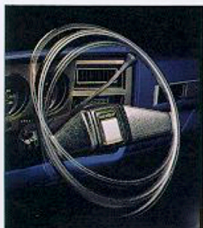
Optional Comfortilt steering wheel.

Custom Molding Package, Black Deluxe Molding Package, Bright ■ Operating Convenience Package (Power Door Locks and Power Windows) ■ Paint Options: Special Two-Tone Paint Exterior Decor Package ■ Radio Equipment, Delco AM/FM Stereo Radio w/Digital Clock