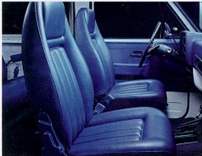
Standard (Custom Deluxe) interior with Custom Vinyl.

bucket, it automatically slides forward to provide passage, then returns easily to position.