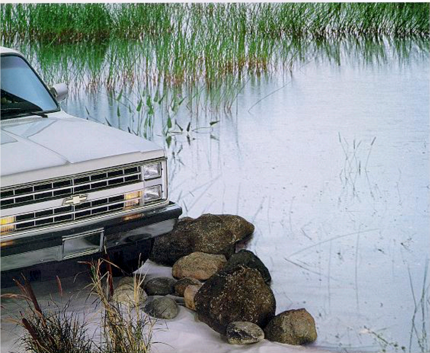
Full-Size Blazer in Frost White with optional Silverado trim. Tires supplied by various manufacturers.

Full-Size Blazer with Special Two-Tone paint. A properly equipped Blazer can move up to 12,000 lbs., including vehicle, trailer, passengers, cargo and equipment.