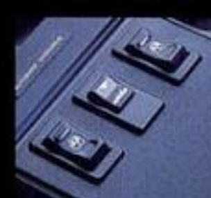
Optional power windows.