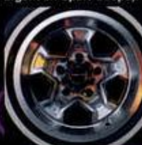
Optional Sport Coupe Rally Wheel.