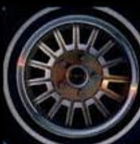
Optional aluminum-finned wheel (gold on Berlinetta, argent on Sport Coupe).