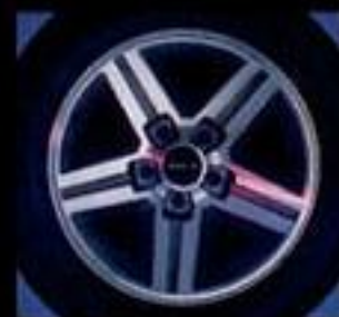
IROC-Z 16" standard aluminum wheel.