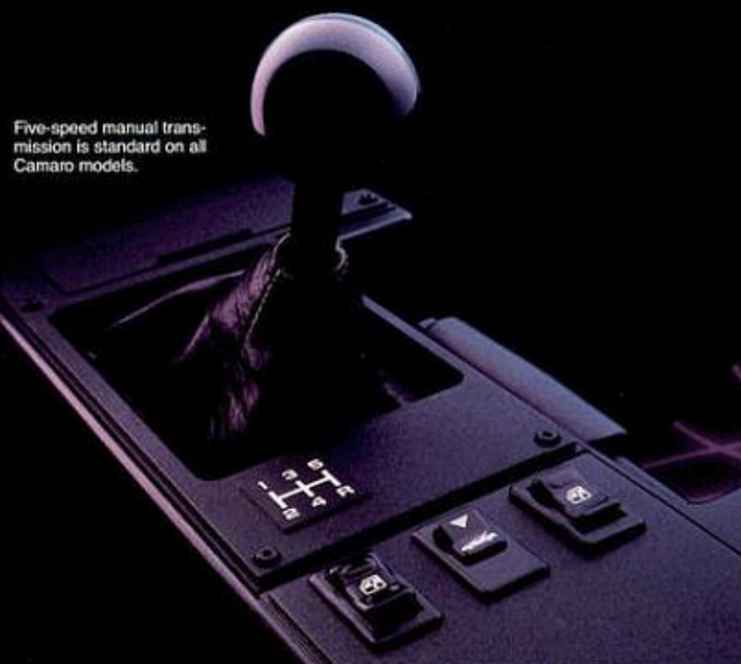
Five-speed manual transmission is standard on all Camaro models.