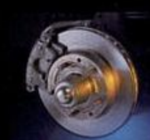
Power 4-wheel disc brakes available.