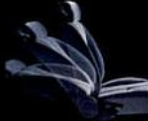
Front seats recline.