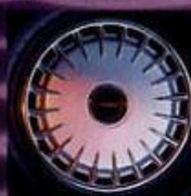
Optional Sport Coupe cover.