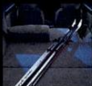
Split-folding rear seat-backs are available.