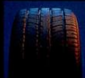
IROC-Z features P245/50VR-16 radials.