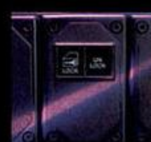
Optional power door locks.