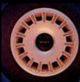
Standard Berlinetta wheel cover.