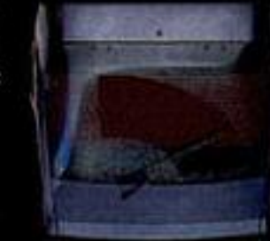
Rear window wiper/washer and electric defogger are welcome options in foul weather.