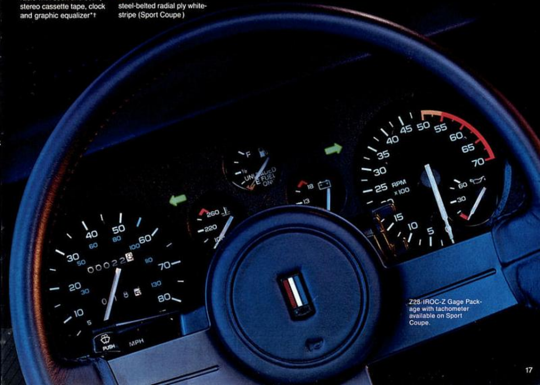
Z28/IROC-Z Gage Package with tachometer available on Sport Coupe.