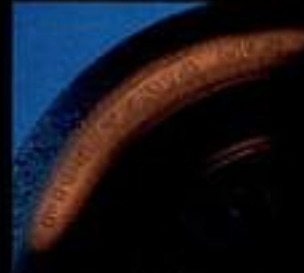
All-season M + S-rated tires are standard on Berlinetta/Sport Coupe.

GM Protection Plan An option that offers service protection in addition to that provided by GM's new-vehicle limited warranty. Coverage available only in the U.S. and Canada. Ask your dealer about it.