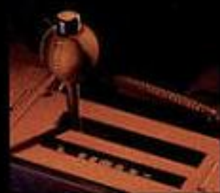
Four-speed overdrive automatic transmission is available.