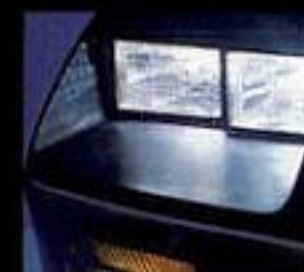
High/low halogen headlamps are available.