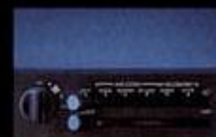
Optional air conditioning.