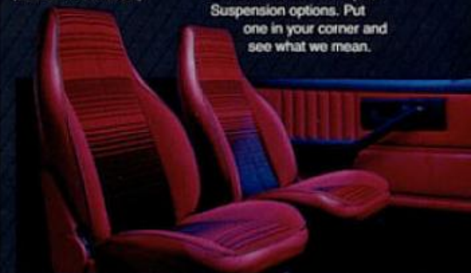
Camaro Sport Coupe features standard reclining bucket seats in your choice of new vinyl or optional cloth.

one in your corner and see what we mean.