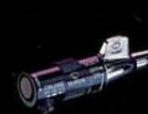
Optional electronic speed control includes resume and speed adjustment features.