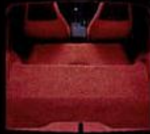
Rear seat-back folds flat for 31.0 cubic feet of cargo space.