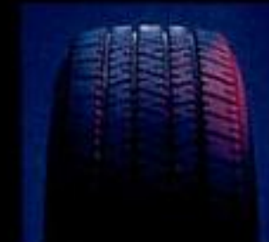
P215/65R-15 Eagle GT's are standard on Z28.