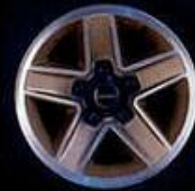
Z28 standard aluminum wheel.