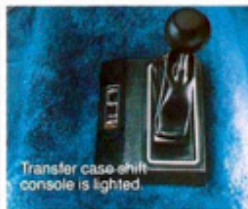
Transfer case shift console is lighted.