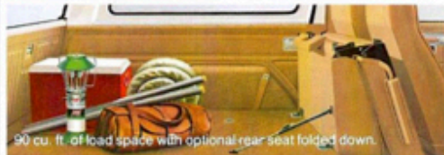
90 cu. ft. of load space with optional rear seat folded down.