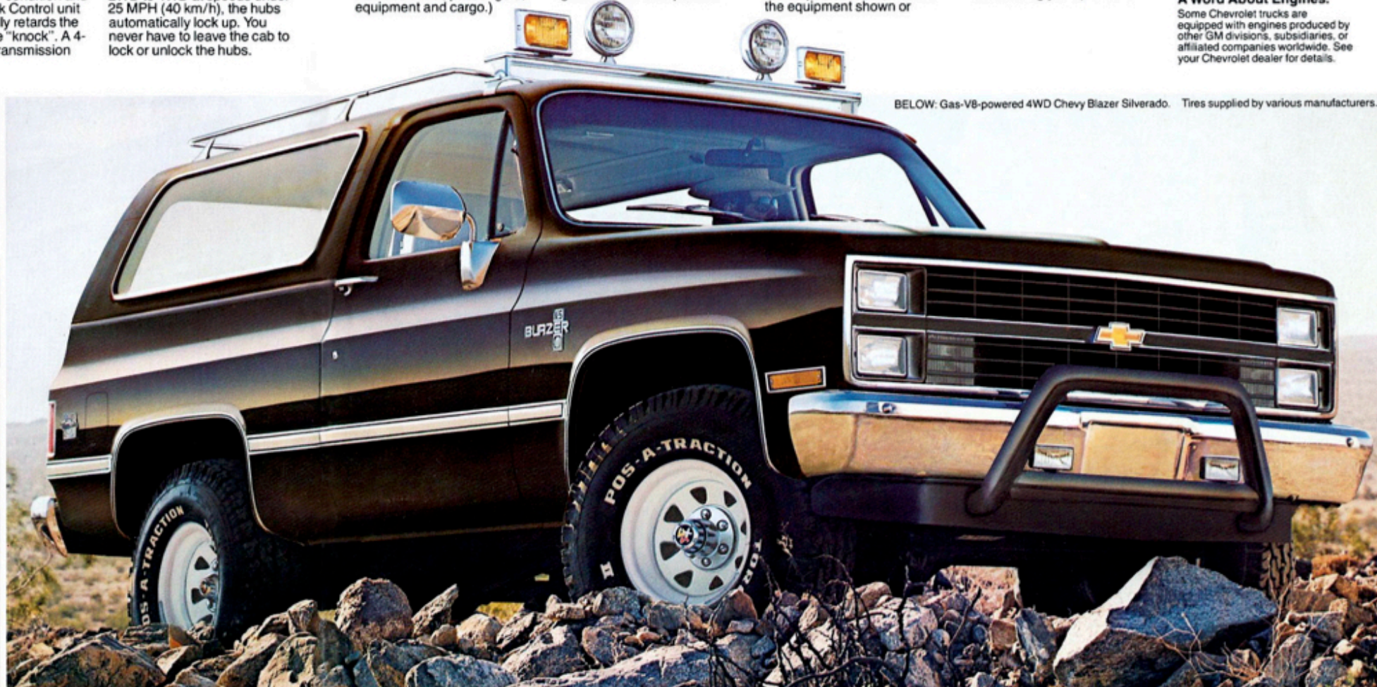
BELOW: Gas-V8-powered 4WD Chevy Blazer Silverado. Tires supplied by various manufacturers.