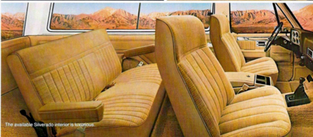
The available Silverado interior is luxurious.