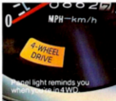
Panel light reminds you when you're in 4WD.