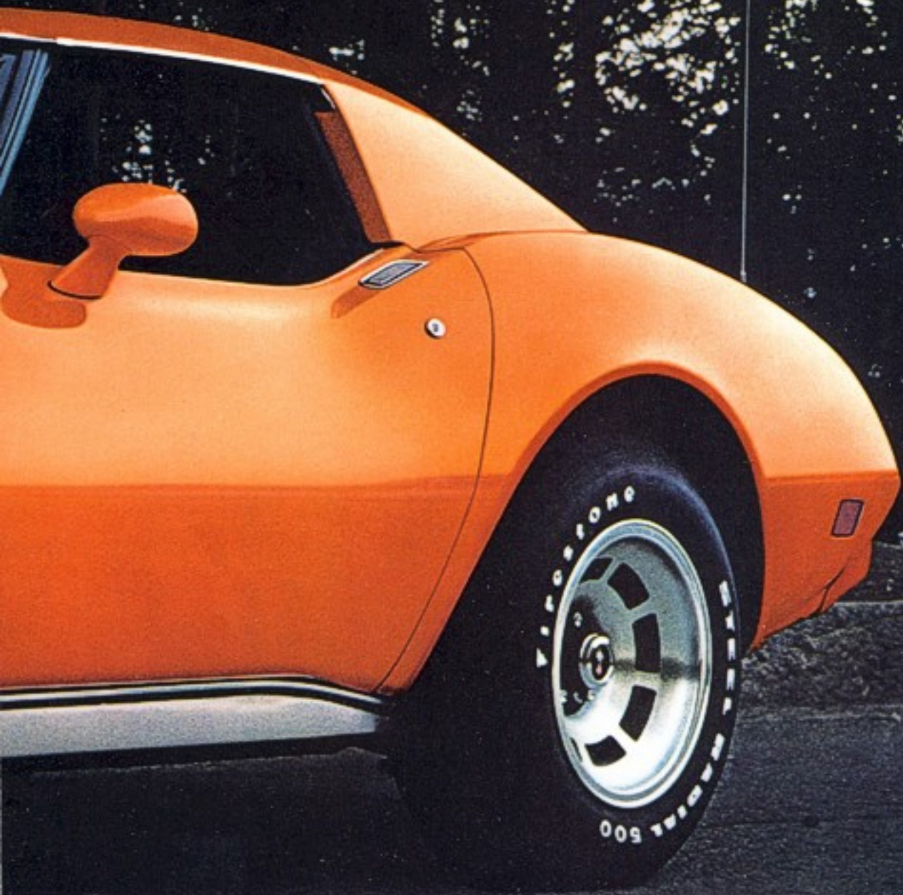
Corvette Coupe. Shown with available sport mirrors, AM/FM radio, cast aluminum wheels and white lettered tires.