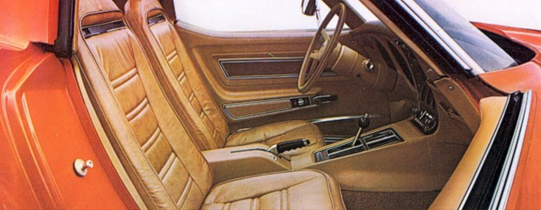
Available Custom Interior with genuine leather seat trim panels.