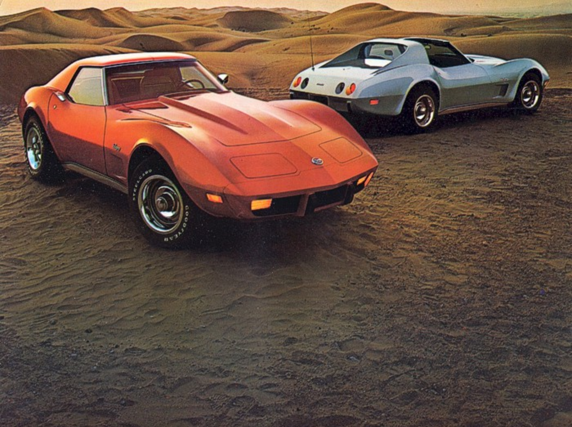
Corvette Stingray Coupe. (also on cover). In foreground, shown with available white lettered tires. In background, shown with roof panels removed.