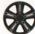
19" Black-Painted Machined Aluminum Optional on GT Premium (California Special Package)