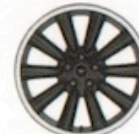
19" Black-Painted Aluminum Standard on Boss 302