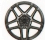
19" Premium Painted Forged-Aluminum Standard on Shelby GT500