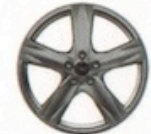
19" Premium Luster Nickel-Painted Aluminum Optional on GT Premium