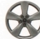
18" Sparkle Silver-Painted Aluminum Standard on GT and GT Premium