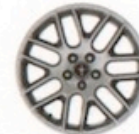
18" Polished Aluminum Optional on V6 Premium (Pony Package) and GT Premium