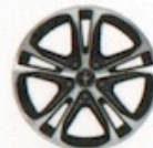
17" Machined Aluminum with Painted Pockets Standard on V6 Premium