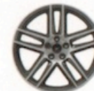
19" Sterling Gray-Painted Machined Aluminum Optional on Boss 302 (Laguna Seca Package only)