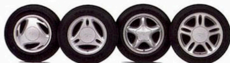
▲ Left to right: 15" wheel covers (standard on Mustang); 15" cast aluminum wheels (optional on Mustang); 16" cast aluminum wheels (standard on Mustang GT); and 17" cast aluminum wheels (optional on Mustang GT).

*See Preferred Equipment Packages 243A and 249A listed at left. †See Preferred Equipment Package 249A listed at left. *Requires the electronic AM/FM stereo with cassette player and premium sound audio system or the MACH 460 Sound System.