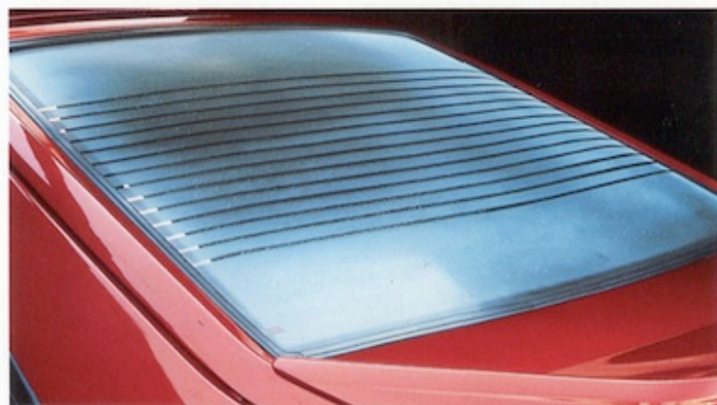
The rear window defroster option enhances visibility by keeping the window clear of frost or mist.