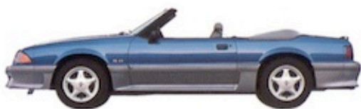
Mustang GT Convertible