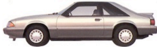
Mustang LX 2-Door Hatchback