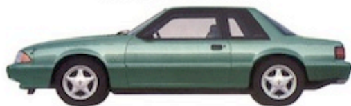
Mustang LX 5.0L 2-Door Sedan