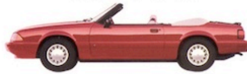
Mustang LX Convertible