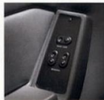
Left: Fold down one or both of the 50/50 split rear seat backs (hatchback model). Between the front seats is a mini-console with armrest. Power window and door lock controls (Preferred Equipment Package features) are located on an ergonomic door armrest. Some equipment shown on these pages is optional.

Mustang has safety features designed to help you avoid an accident. Like well-engineered steering and suspension systems.