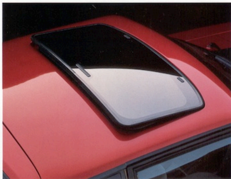
Left: The flip-up open-air roof option, for the hatchback model, lets in extra fresh air (when opened) and more sunshine.

To further personalize your Mustang, choose from the selection of options available separately, some of which are shown here.