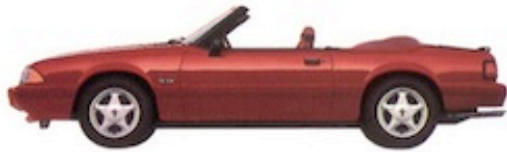
Mustang LX 5.0L Convertible