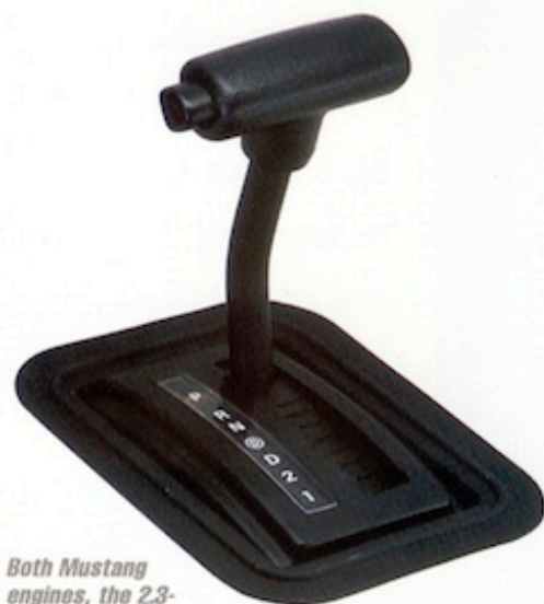
Both Mustang engines, the 2.3- and 5.0-liter, can be teamed with the convenience of an optional floor-mounted automatic overdrive transmission.