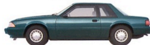
Mustang LX 2-Door Sedan

Also in Mustang LX's list of standard features are power steering, power front disc/rear drum brakes, and nitrogen gas-pressurized hydraulic front struts and rear shocks. Plus many features for your comfort and safety, including a driver-side air bag Supplemental Restraint System (SRS) designed for use with your safety belts.