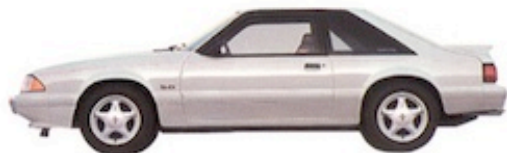
Mustang LX 5.0L Hatchback