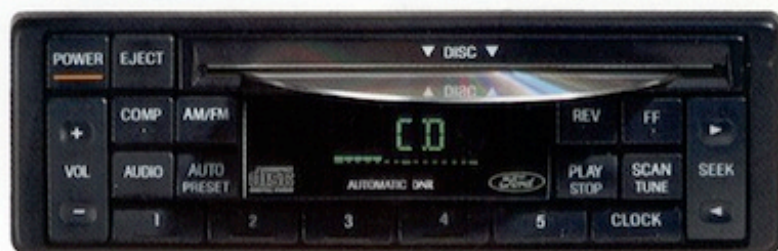
Now available for your listening enjoyment are the extraordinary clarity and performance of Mustang's new 80-watt compact disc player option.