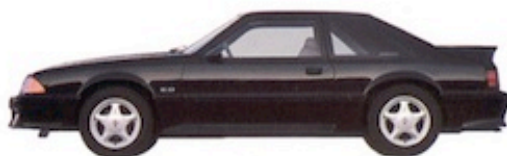
Mustang GT 2-Door Hatchback

The Mustang LX combines sporty styling with the spirited yet economical performance of a 2.3-liter I-4 engine, equipped with two spark plugs per cylinder and the precise fuel delivery of a multi-port electronic fuel injection system (EPA estimates unavailable at press time).