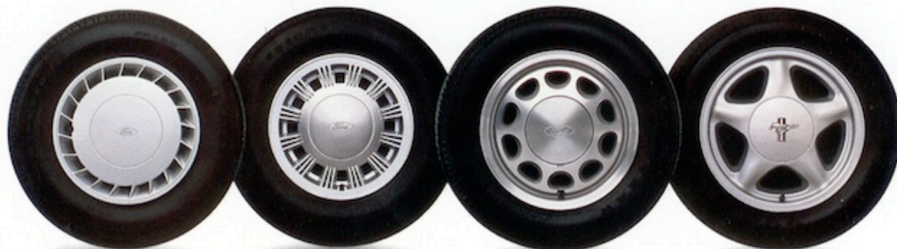
Left to right: finned wheel cover (standard on LX); styled road wheel (included in LX Preferred Equipment Package); cast aluminum wheel (optional on LX); and 5-spoke cast aluminum wheel (standard on GT and LX 5.0L).