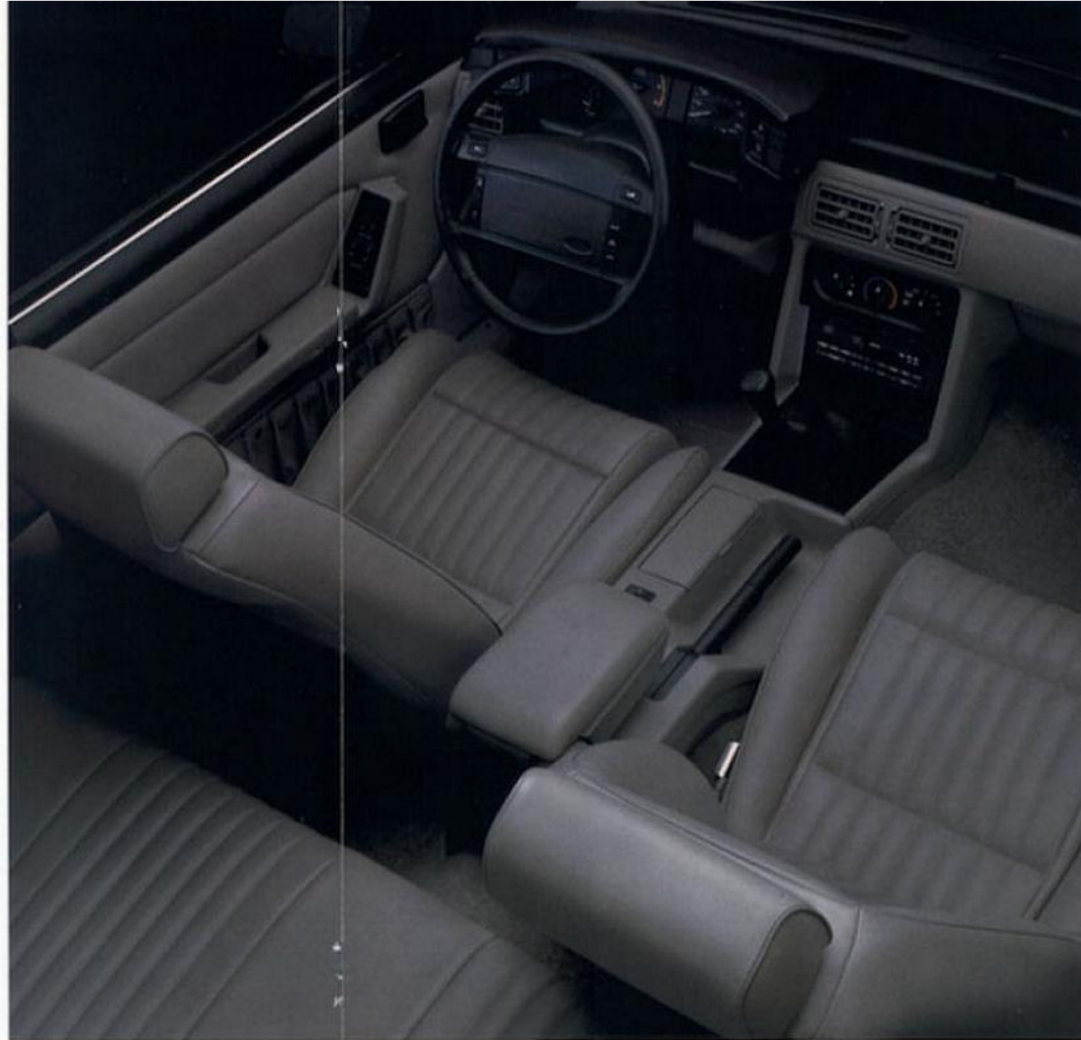
Above: Articulated sport bucket seats, standard in GT and LX 5.0L, shown with available leather trim in Opal Grey.