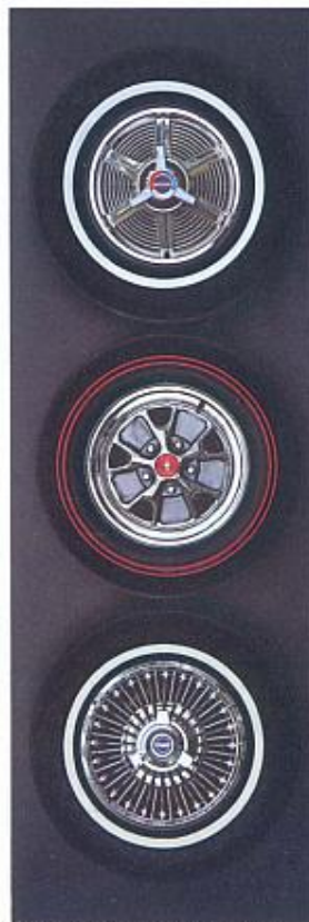
Deluxe Wheels and Wheel Covers