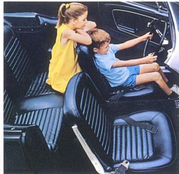
Six all-vinyl trim choices with the look and feel of leather

◀ For sports Mustang add sports options (next page) to Mustang Convertible