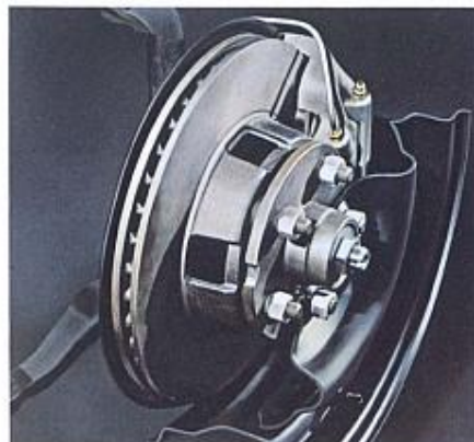
Front Disc Brakes