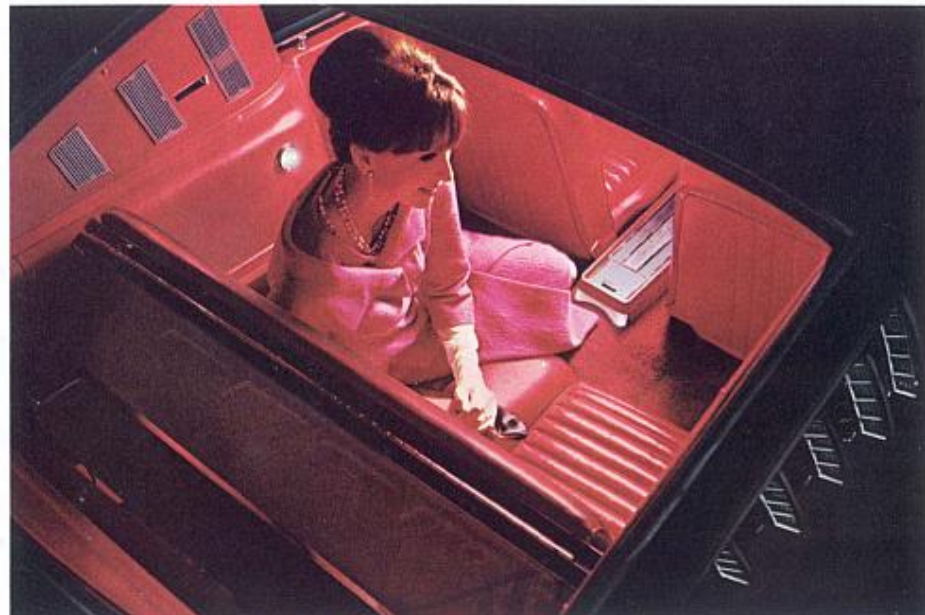
Rear seat luxury in the 2+2