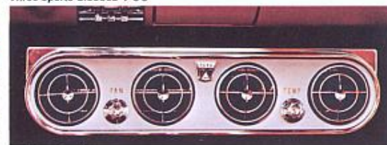
Ford Air Conditioner