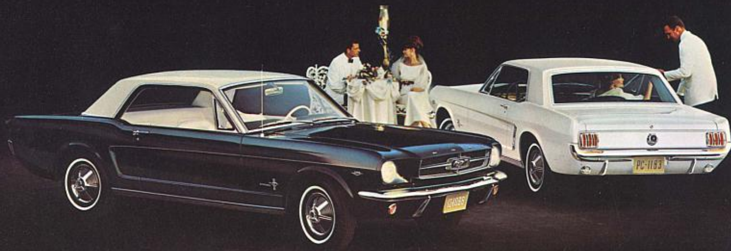
Mustang options make a luxurious personal car (right) of Mustang Hardtop (far right)