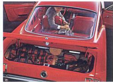
Folding rear seat triples luggage space