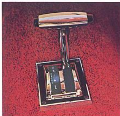
T-bar Cruise-O-Matic Drive

†Replaces side air scoop ornament; rocker panel moldings standard on Fastback