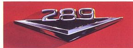
Three sports-blooded V-8's