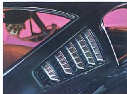
2+2's Silent-Flo Ventilation louvers

The Fastback 2+2 comes on bold with style you'd expect only from Europe and only at very high prices. But this one's a Mustang, with the kind of low price Mustang's already famous for.