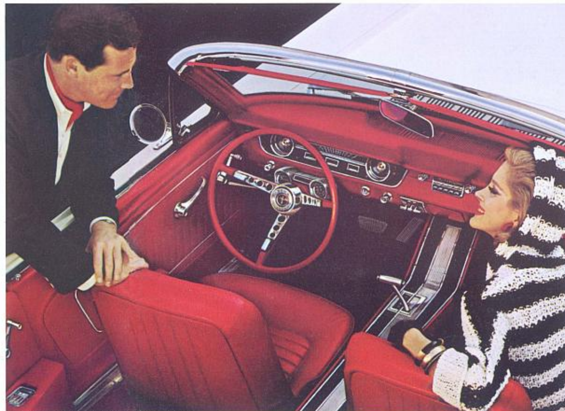
Convertible Interior illustrating many Mustang options