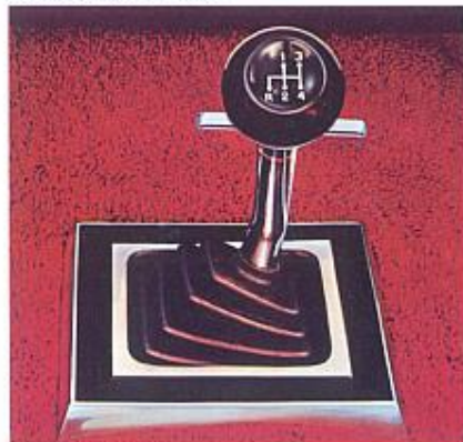
4-Speed Stick Shift