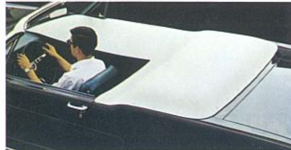
Tonneau cover adds true sports-car flair