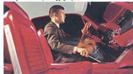
2+2 cockpit: where spirited looks come alive!

◁ Fastback 2+2: imported looks at a low Ford price