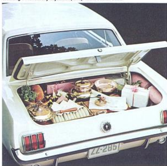
Trunk is surprisingly spacious, easy to load