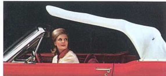
Power top is one of over 70 options