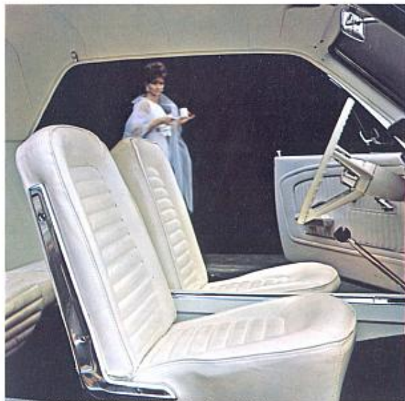
Mustang's individually adjustable, deep-foam bucket seats