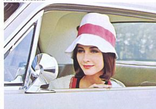
Remote-Control Outside Mirror